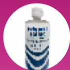
SALINE SOLUTION OR PHYSIOLOGICAL SALINE 1 LITRE

They can be bought in chemists and in a general store