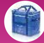
COOL BOX ISOTHERMAL