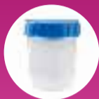
STERILE PLASTIC JAR 4 PIECES